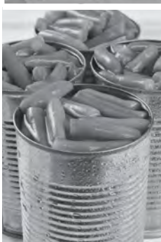
CANNED GREEN BEANS